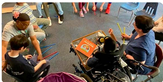
KELLY MARKS and APRIL WEITKAMP, Lowell Elementary "Implementation of Comprehensive Literacy for all"

The grant enabled us to enhance our curriculum with engaging, interactive literature and tools, creating an inclusive, multi-sensory reading experience for all students. This approach fostered a sense of belonging, allowing students to participate fully in library activities alongside their peers. Regular practice with chosen and instructional books improved their book-handling skills, enriching their library visits and encouraging a love for reading and exploration.